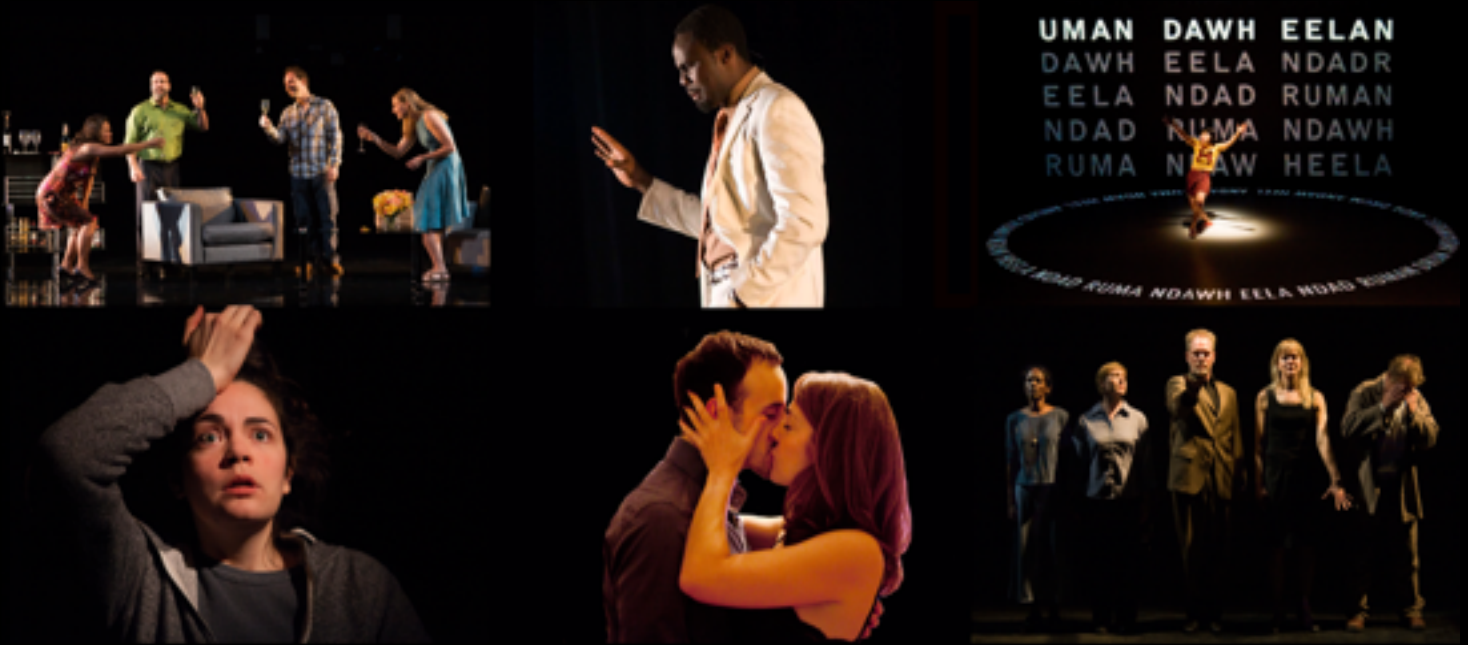
Top L to R: Peggy Pickit Sees the Face of God , Shine Your Eye , The Four Horsemen Project . Bottom L to R: Infinity , A Synonym for Love , Goodness .

Volcano is an international award-winning theatre company based in Toronto. Our main focus is the building of experimentally crafted yet highly accessible live performance works.